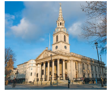
St Martin-in-the-Fields Church